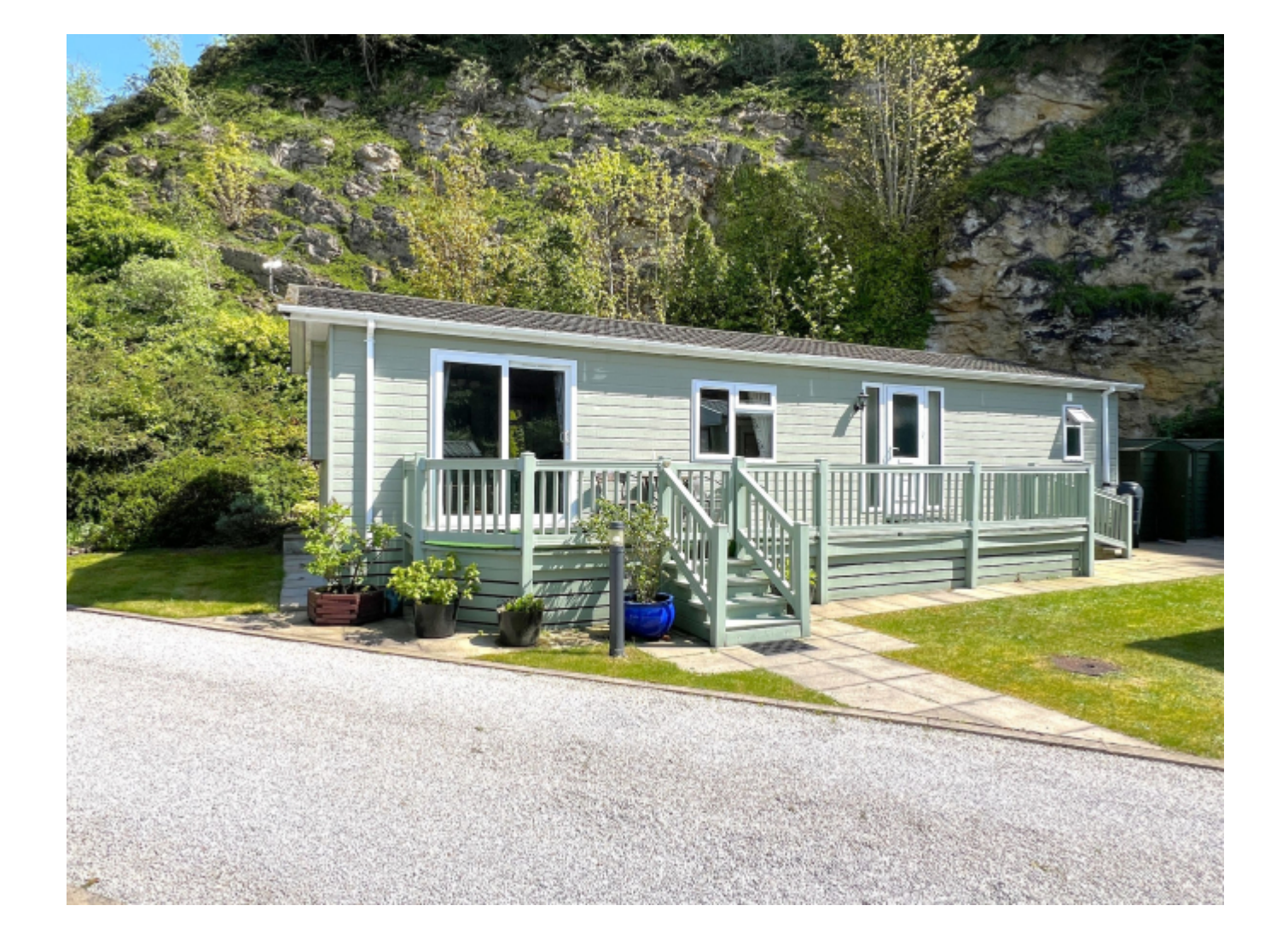
£125,000 Guide Price

Low Bridge Park, Abbey Road, Knaresborough Park Home | 2 Bedrooms | 2 Bathrooms