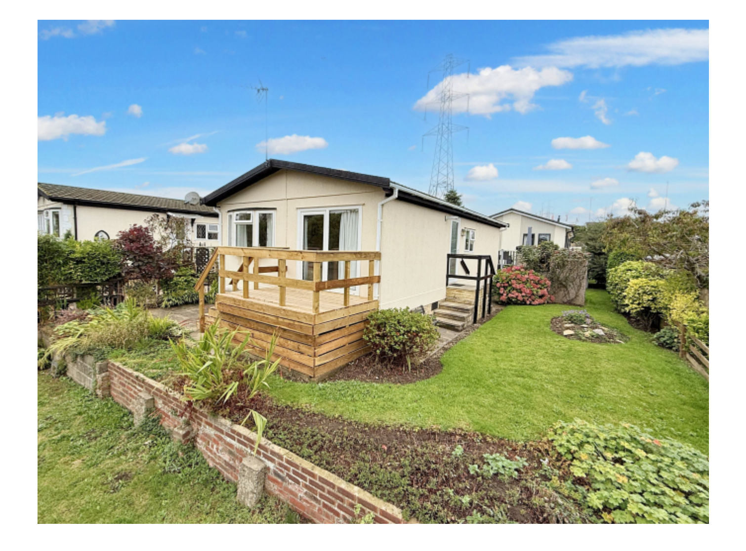
£145,000 Offers Over