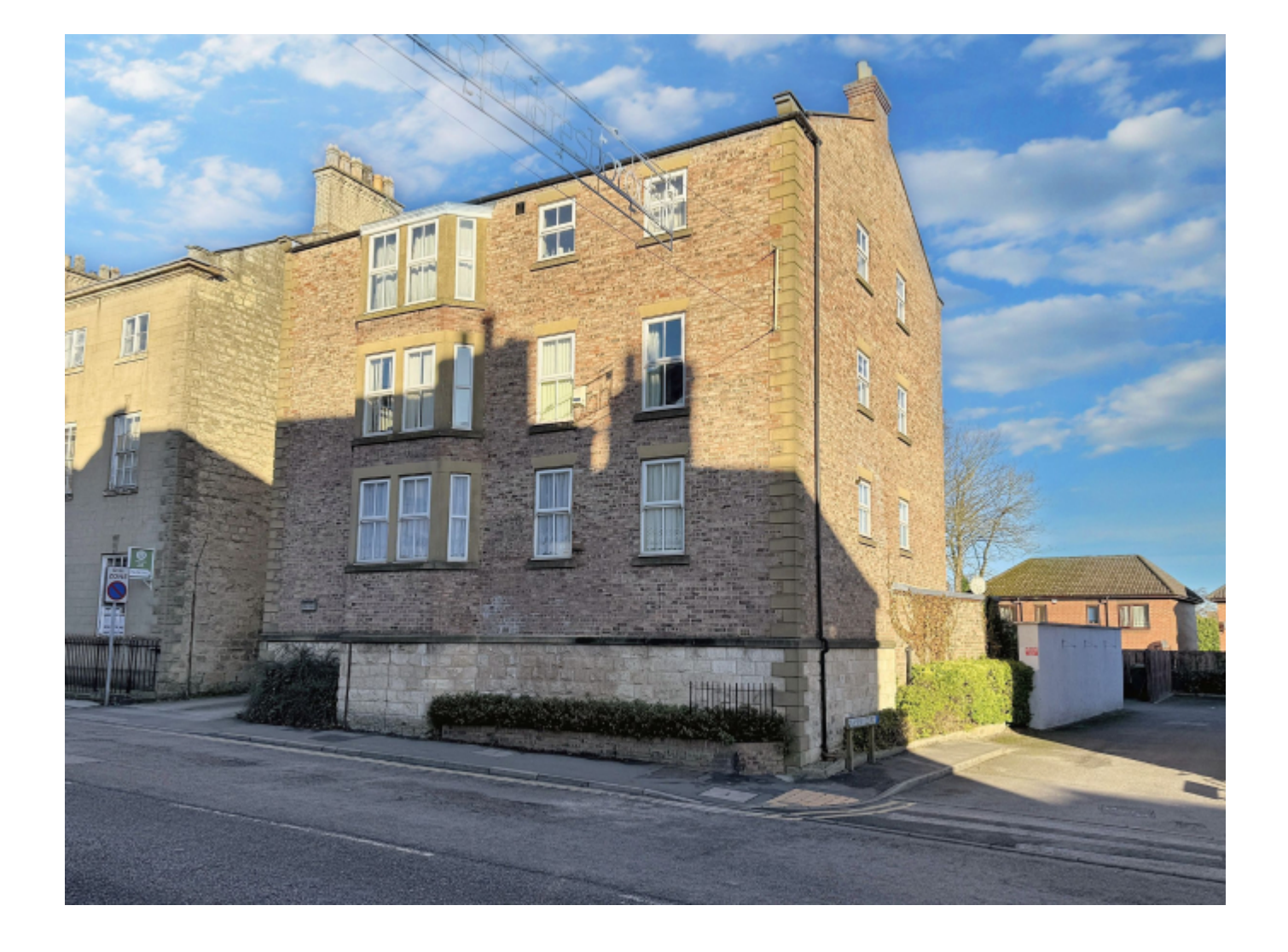
£155,000 Guide Price