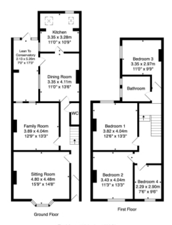
Total Area: 152.0 m² ... 1636 ft² All measurements are approximate and for display purposes only. No liability is accepted by either the agency or Box Property Solutions Ltd as to the exact measurements of the rooms. Box Property Solutions Ltd retains the copyright on this plan and allows agents to use it with agreed permission.

This floorplan is for illustrative purposes only and the location of doors, windows and other items are approximate.