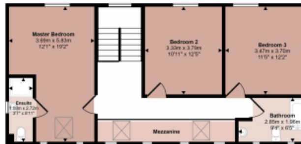
First Floor Approx 65 sq m / 700 sq ft

This floorplan is only for illustrative purposes and is not to scale. Measurements of rooms, doors, windows, and any items are approximate and no responsibility is taken for any error, omission or mis-statement. Items of items such as bathroom suites are representations only and may not look like the real items. Made with Magic Squippy 360.