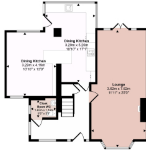
Ground Floor Approx 88 sq m / 129 sq ft

Approx Gross Internal Area 125 sq m / 1340 sq ft